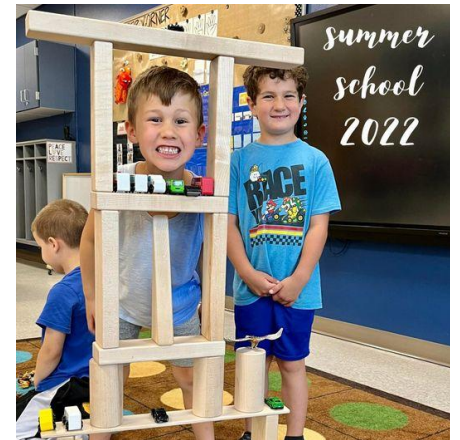
Summer School builders

Shell Lake Summer Schoolers are all set to travel! Their imagination has them seated and ready for a trip to California! "This is not an airplane though—it costs too many dollars to fly so we're driving!"