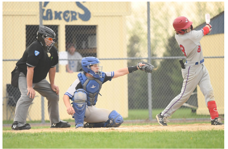
Photo Credit: Amy Skattebo! Thanks for capturing great photos of our Shell Lake athletes!!

The JV team will travel to Grantsburg on Friday for a 4pm game.