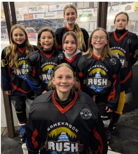
The 12u Silver Girls State is February 28th and March 1st in Stoughton, Wisconsin Good Luck Lady Lakers!