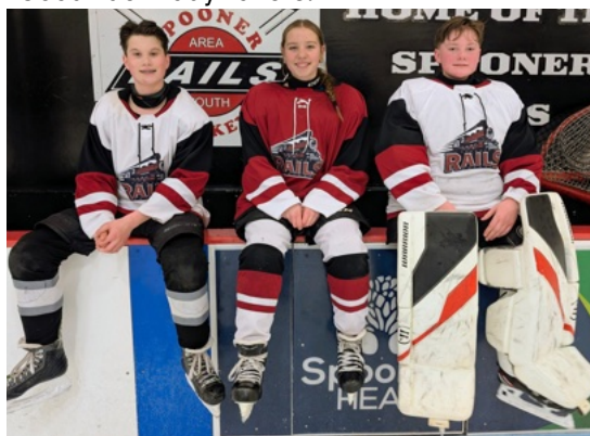
Good Luck to our Shell Lake Bantam Hockey players who will be competing at state this weekend in Waupun!